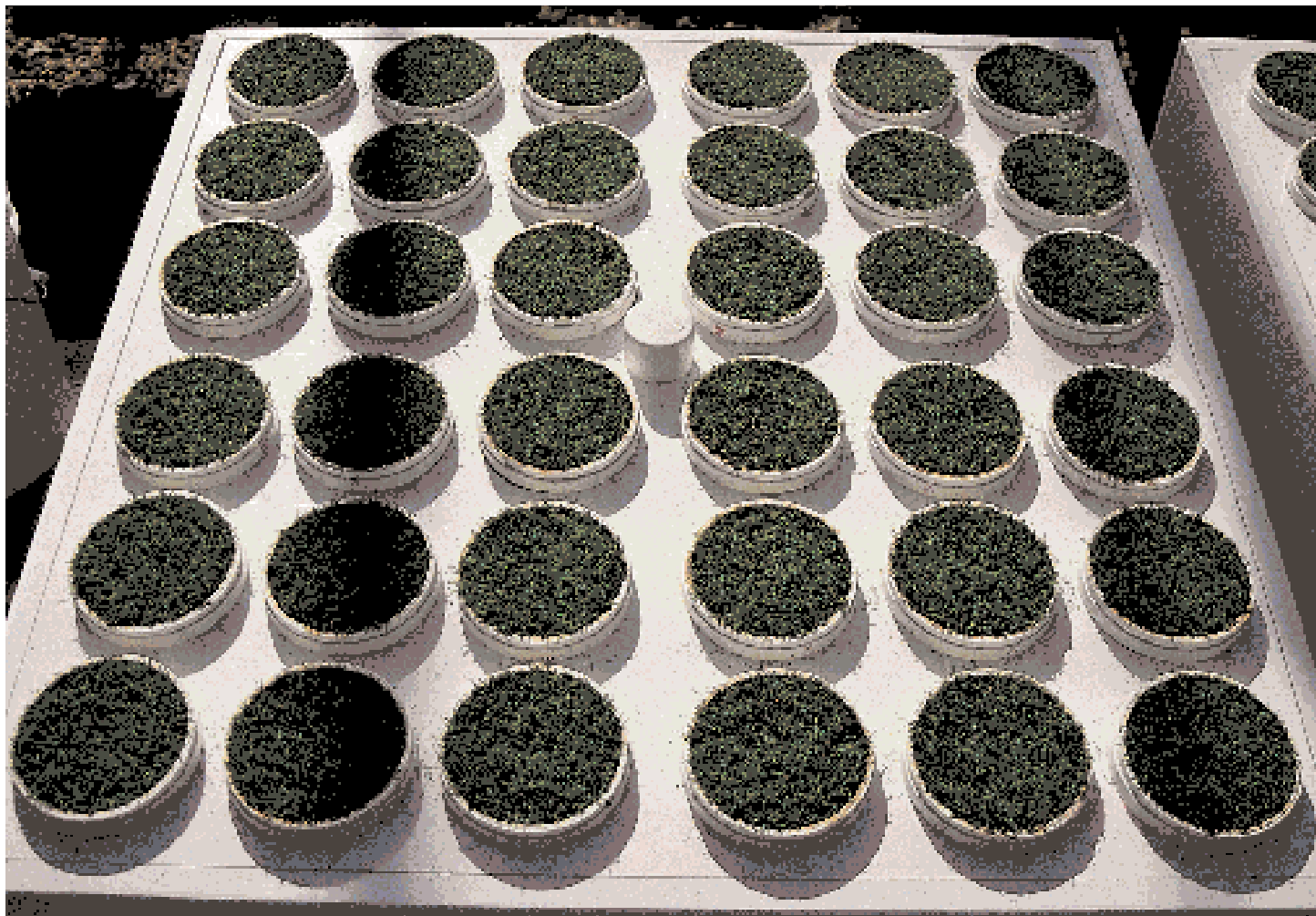
A greenhouse hydroponic culture system was used for humic acid evaluation.

Increased root enzyme activity suggests that root respiration was increased substantially by humic substances. There is a close connection in plants between the energy-releasing process of respiration and the energy-consuming process of growth. Thus, increases in root growth might be due to the stimulation of enzyme systems by increased respiration.